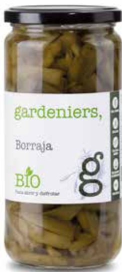
Bourrache au naturel 400 g