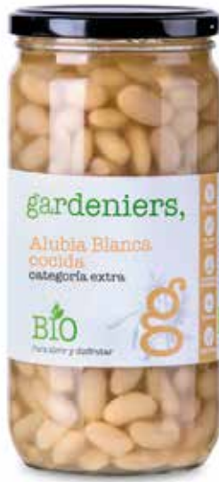
Cooked Beans 450 g