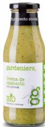
Cream of courgette with quinoa 490 g