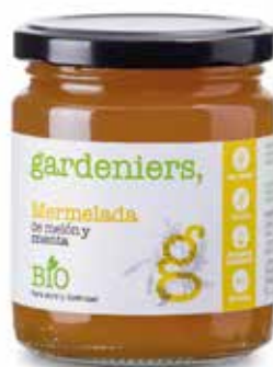
Melon and mint marmalade 250 g