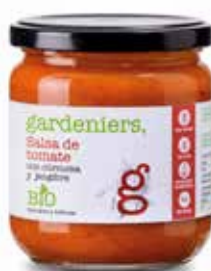
Tomato sauce with turmeric and ginger 330 g