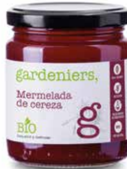
Cherry jam 250 g