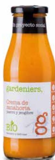
Cream of Carrots with leeks and ginger 490 g