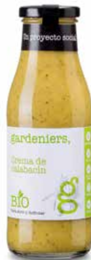
Cream of courgette 490 g