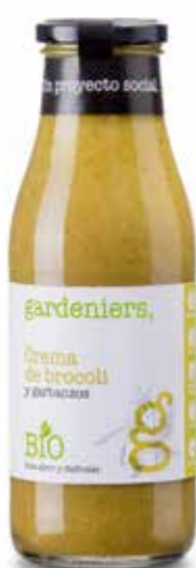
Cream of broccoli and chickpeas 490 g