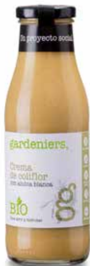
Cream of cauliflower with white beans 490 g