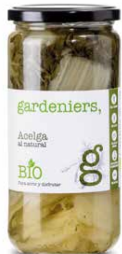
Blettes au naturel 400 g