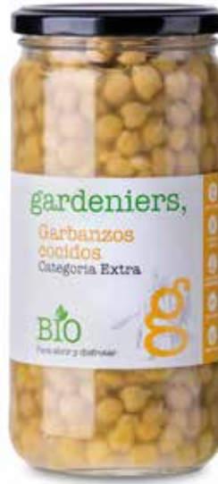
Cooked Chickpeas 450 g