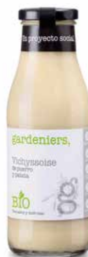
Leek and potato vichyssoise 490 g