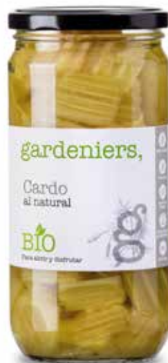
Cardons au naturel 400 g