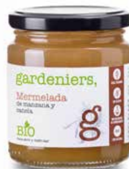
Apple marmalade with cinnamon 250 g