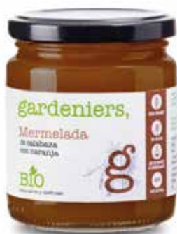
Pumpkin marmalade with orange 250 g