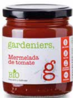
Tomato jam 250 g