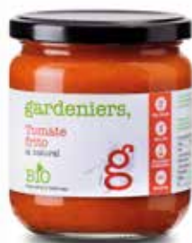
Tomato sauce 330 g