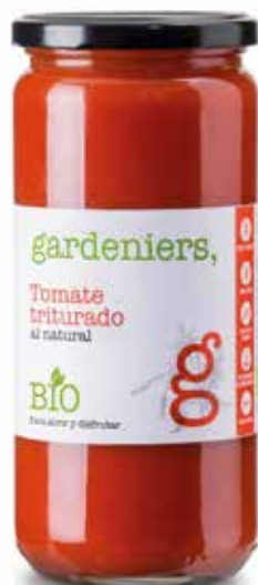
Crushed tomatoes 660 g