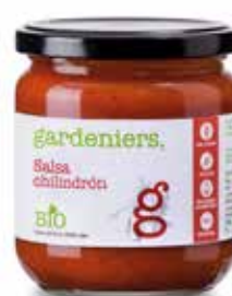
Tomato and pepper sauce 300 g