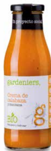
Cream of pumpkin and apple 490 g